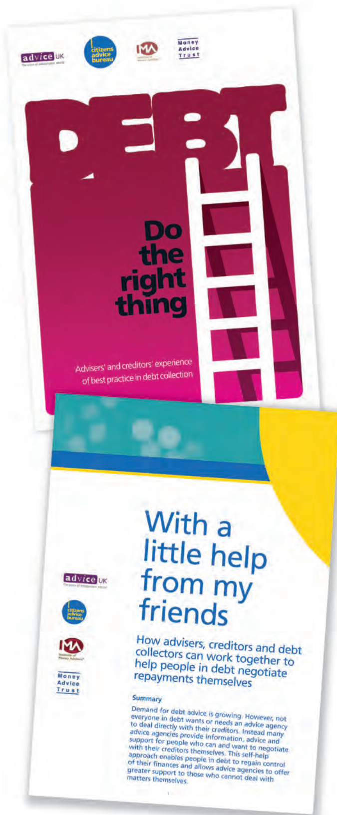
Do the right thing , published 2010 and With a little help from my friends , published 2008