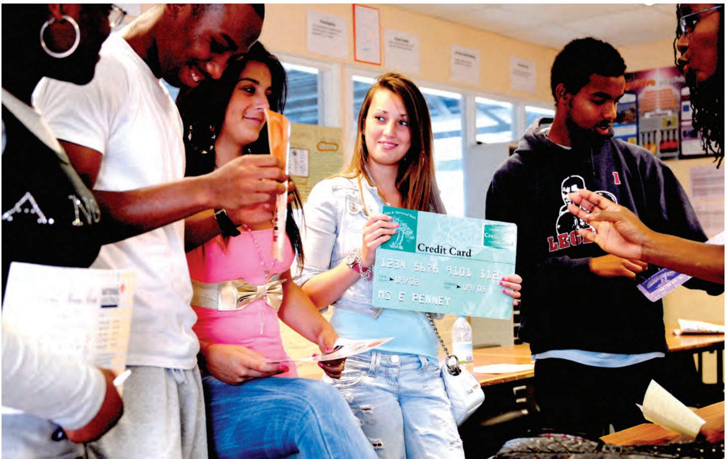
Financial capability session at Whitefield School, London

Long-term backing from Prudential plc has helped bureaux and their community partners deliver high-quality financial education programmes for nearly