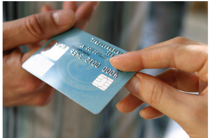
New rights for credit card holders

to achieve best practice in debt collection. It also calls on creditors to join us in a conversation about how these steps can be put into practice.