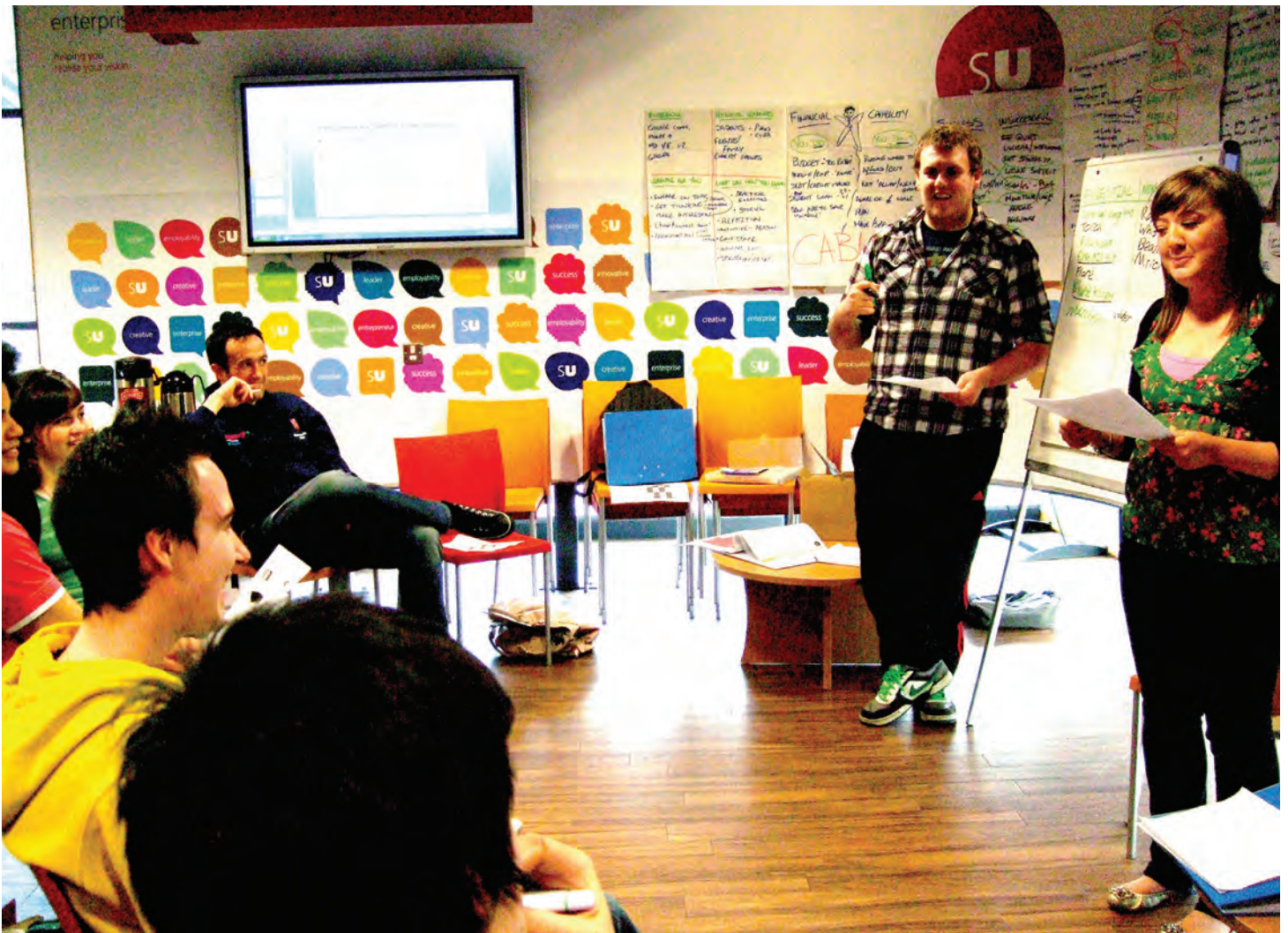
MoneyActive session at Queens University Student Union, Belfast

Providers were particularly successful at reaching those who tend to be more financially excluded – of those trained 42 per cent were disabled, 22 per cent lone parents, 28 per cent over 50 and 15 per cent from black, Asian and minority ethnic (BAME) communities. Feedback from participants was very positive and in a follow up survey of 108 participants 90 per cent had already taken action to improve their financial situation with budgeting being the most popular step.