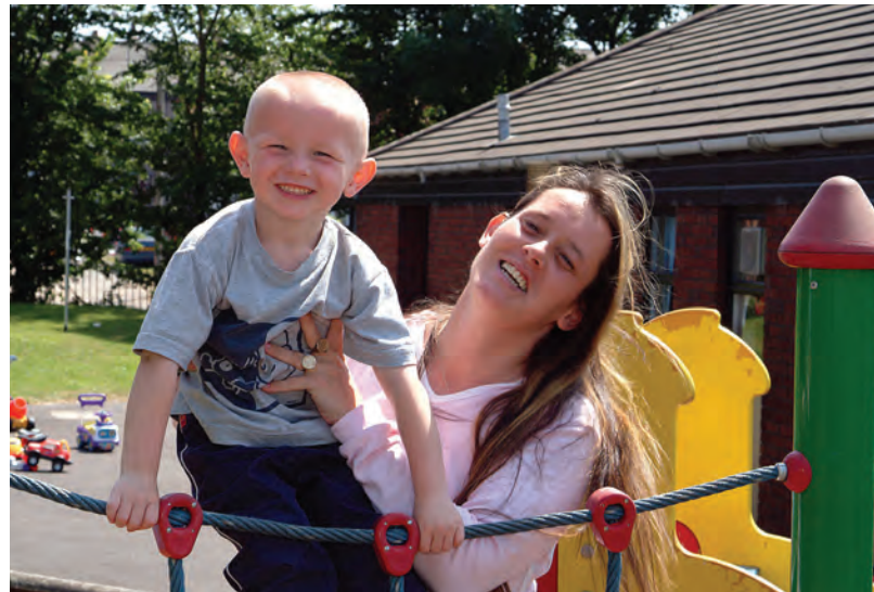
The Horizons project is helping lone parents

We have also shared our experience with policy makers and, with financial support from The Money Advice Service, have established a network of regional