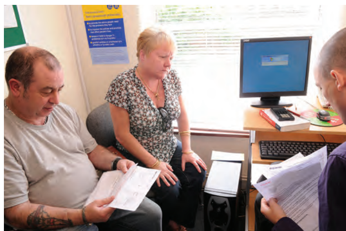
Free, face-to-face advice is available from bureaux across England and Wales